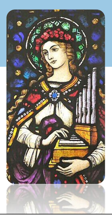
St. Cecilia, pray for us!